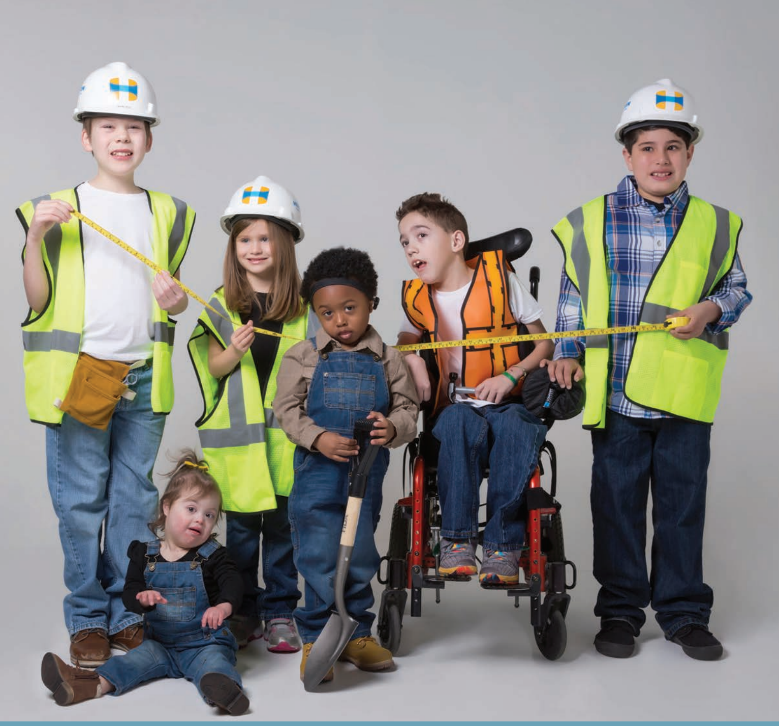
EXPANDING POSSIBILITIES HEARTSPRING CAMPLIS EXPANSION PROJECT